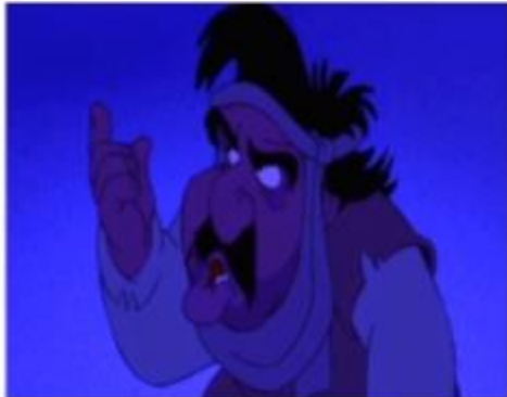
'Aladdin' (1992), Ron Clements (Dir.), © Disney Image: Fox Federation

Widget Symbols©Widget Software 2002-2020 www.widget.com